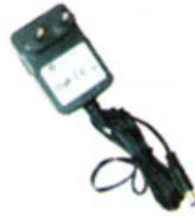
KTC-23 Switching power

The standard accessories supplied for the radio have a variety of specification options adaptable to different countries and regions.