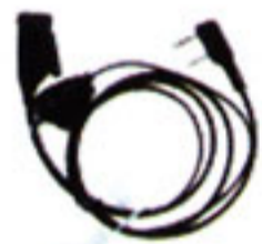
KME-009 Earpiece Mic