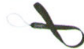
KGS-01 Hand strap