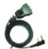
KPSL-02 Programming Cable