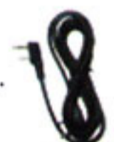
KCL-01 Cloning Cable