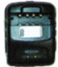
KBC-33D1 Desktop charger