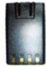
KB-33L Li-ion 110mAh Battery pack