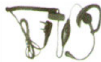
KME-005 Earpiece Mic